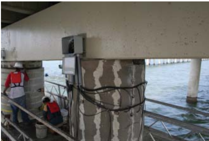
Each piece of reinforcing steel in the pile section is brazed to a lead wire and connected to a junction box on the pile cap.