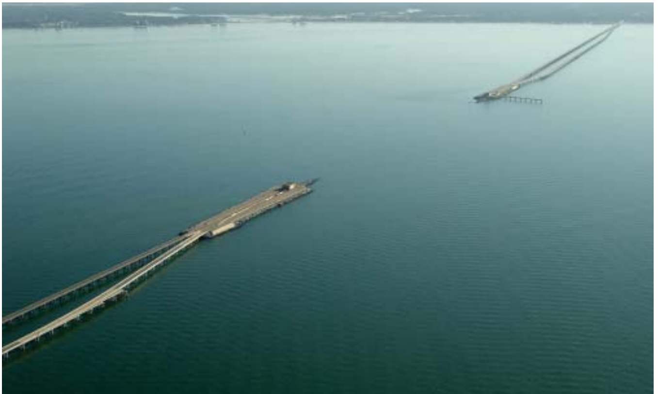
The Chesapeake Bay Bridge-Tunnel is a total of 23 miles long and connects the Delmarva Peninsula to the Norfolk/Virginia Beach area.

With a total length of 23 miles (37 km) and a shore-to-shore length of 17 miles (27.4 km), the bridge-tunnel features 12 miles (19.3 km) of low-level trestle; two one-mile (1.6-km) tunnels; two bridges; two miles (3.2 km) of causeway; four man-made islands, approximately 5.25 acres each with an elevation of 30 ft (9 m) above the water; and 5.5 miles (8.8 km) of approach roads. Built and operated by the Chesapeake Bay Bridge and Tunnel District, a political subdivision of the