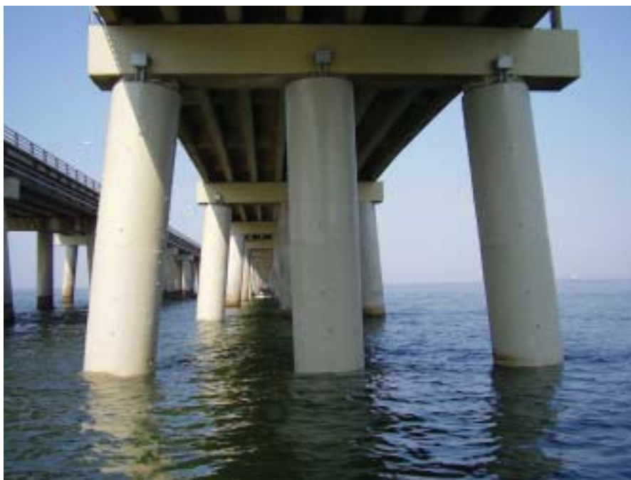
Bridge piles with installed galvanic CP jackets.

To do this, installers drill from the face of the pile into the concrete to expose a portion of the reinforcing steel, including the spiral wire and each prestressing strand, and then braze an American Wire Gauge (AWG) no. 10 copper wire onto the steel. Epoxy is applied at the connection point and the drill hole is plugged with grout material. “The piles have a unique reinforcement configuration because the reinforcing spiral wire in each segment is independent rather than continuous. So the spiral wire in each pile segment under the jacket must be connected,” Leng says. “Consequently, we use as many as 60 wires per pile for a single jacket system to ensure that all the steel is protected.”