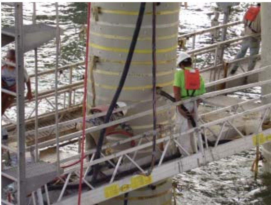
Installers fill the CP jacket with cementitious material to form a single monolithic fill about 2 in. thick.

hit the piles squarely, which caused hairline fractures in the top of the concrete. At the time, those involved with building the bridge didn't anticipate that the fractures would cause problems. As construction continued, improvements were made to the process of driving piles and newer sections of the bridge didn't experience installation damage to the piles.